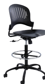
Zippi™ Plastic Extended-Height Chair