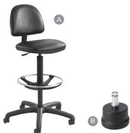
Precision Vinyl Extended-Height Chair with Footring

Mayline–Safco also offers more stationary options to ensure seat accessibility to varying work environments among a variety of users.