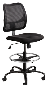
Vue™ Extended-Height Mesh Chair