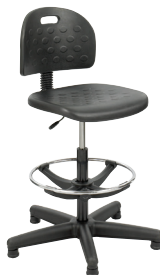
Soft Tough™ Economy Workbench Chair

A Chair / 3406BL B 2" Nylon Glides / 5138 S