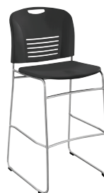
Vy™ Bistro-Height Chair