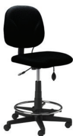
Swivel Task Stool