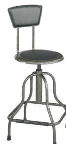
Diesel High Base with Back