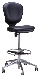
Metro™ Extended-Height Chair